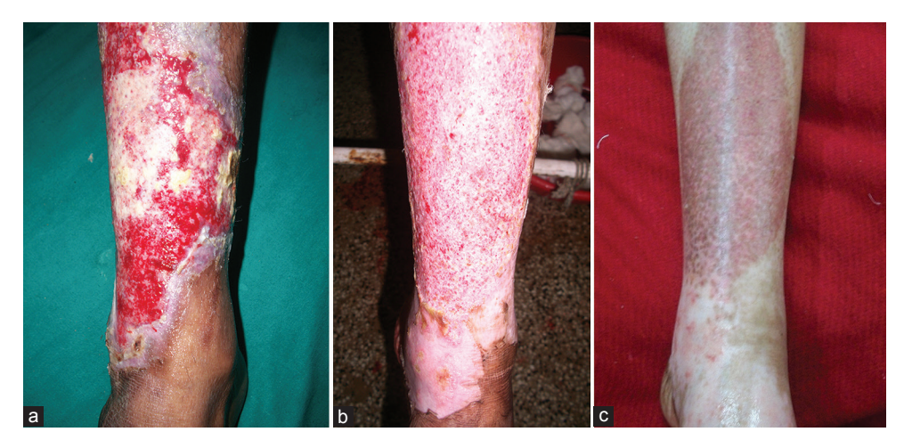
Figure 3: (a) Two weeks old burn ulcer presented for nano-crystalline silver treatment. (b) Ulcer after 10 days and 3 times dressing with nano-crystalline silver gel. (c) Complete wound healing achieved within 23 days with nano-crystalline silver gel

P value is from between group comparison by Fisher's exact test